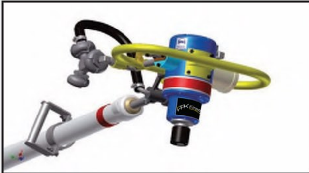
Pictured above complete with FT100 Airleg; Airleg adaptor and 3 way air fitting

Designed and manufactured as an extremely strong and lightweight portable handheld drilling machine